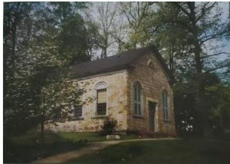
Irvine Presbyterian Church