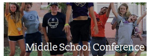
Middle School Conference

The Montreat Conference Center in the western North Carolina mountains sponsors high school conferences at their facilities much of the summer, so they also offer a parallel option for middle schoolers at the Maryville College campus in Tennessee. The Presbytery of Lake Erie takes a group from here to there each year. Participants explore faith, build relationships with other young people from across the country, and strengthen their home faith communities for decades. Each day begins with a gathering of 600 young people in the auditorium for energizers, music, and a top speaker who explores a theme and scripture in all kinds of creative ways – multimedia, drama, storytelling, and more. Small groups of 20 or so have a safe space for further conversation.