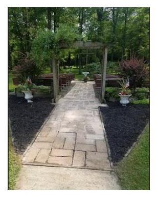
Irvine Church Outdoor Chapel

In addition to hearing the very interesting history of Irvine church, you may enjoy the following highlights during the gathering: a continental breakfast starting at 9:00 am, Presbyterian women's business meeting, singing beautiful hymns, prayer, fellowship with women from all over our presbytery, a delicious lunch served by the PW of Irvine and a visit to the Wilder Museum which is only a few blocks away. (You are welcome to drive or walk to the museum after lunch.) The Wilder Museum of Warren County History houses thousands of artifacts in 17 exhibit rooms including the Irvine/Newbold exhibition, Seneca Nation, Oil, Lumber, Victorian Era, Military, History, Medicine, Agriculture, Railroad, Furniture, National Forge, and much more! It is a true gem for history lovers!